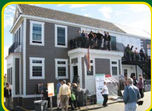
NextGen urban living home by Genesis division of Champion Enterprises wows IBS 2009

2009 International Builders' Show Report Inside!